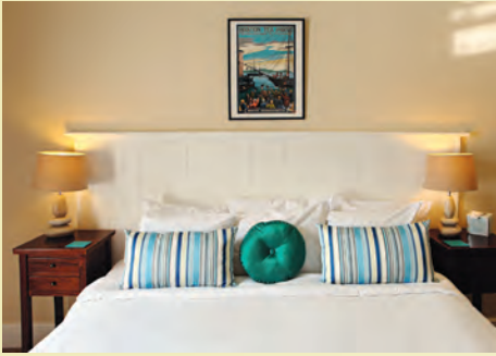
The Boston room