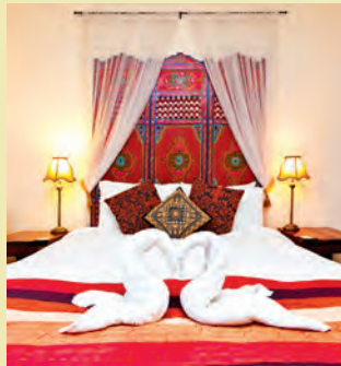
The Marrakesh suite