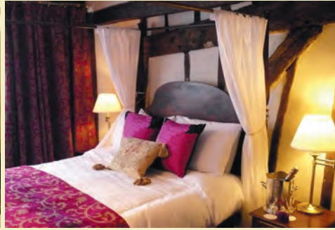
The Canterbury room