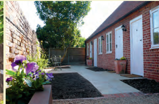
The Stable rooms