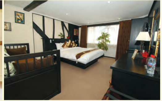
The Tokyo room